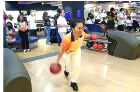
Rotary Inter-club Bowling Tournament... Nov. 13, 2022 at SM Lanang