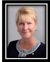
Jennifer E. Jones RI President